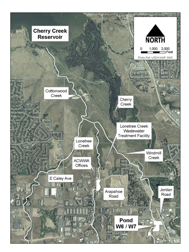
Fig. 4. Aerial photograph (2003) showing location of Pond W-6/W-7, ACWWA Lone Tree Creek Wastewater Treatment Facility, and Cherry Creek Reservoir

In the course of design, ACWWA and their engineers determined that to effectively use the available space, it would be best to create a combined water quality and flood control facility rather than two adjacent, separately functioning facilities. The combined facility was named Pond W-6/W-7. Fig. 4 shows the location of Pond W-6/W-7 relative to the ACWWA Lone Tree