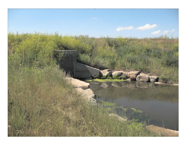
Fig. 5. Pond W-6/W-7 outlet and micropool

jurisdiction. It is less commonly used on smaller ponds. Although the micropool does provide water quality benefits in terms of biological activity in the permanent pool, perhaps the most important feature of the micropool is the role it plays in preventing clogging of the outlet orifice plate. This is achieved by providing a flow path from the micropool into the outlet structure beneath the permanent water surface elevation. While debris often accumulates on the outlet screen and trash rack above the permanent water surface, as the water surface rises and falls during a runoff event, the below-the-water-surface flow path resists the drain and clogging cycle that occurs on the upper part of the outlet.